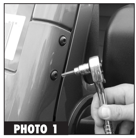
1. Begin by removing the top two bolts along the outer windshield mount on both sides by using a T-40 torx bit (See Photo 1).

Tool Needed: T-40 Torx Bit and 9/16" Socket