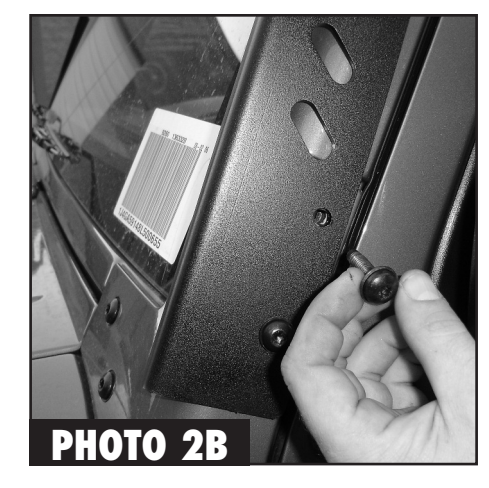
2. Align the mounting brackets with the flat edge facing forward and the form facing the middle of the vehicle (See Photo 2A). Replace the factory bolts and finger tighten them (See Photo 2B).