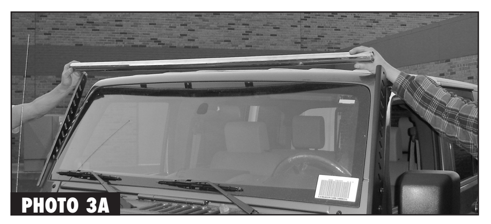
3. Note: It is recommended that two people perform this Step.

Lift the light bar into position and align with the upper mounting holes (See Photo 3A). Use the supplied bolts and washers to secure the light bar and tighten with a 9/16" socket (See Photo 3B).