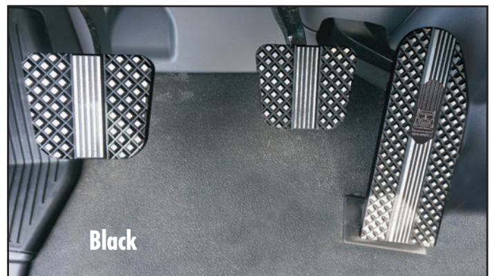
Model No.: RW235-7BP-KW Flat Diamond Cut Billet Pedal Set