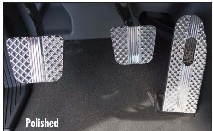
Model No.: RW235-7-KW Raised Diamond Cut Billet Pedal Set