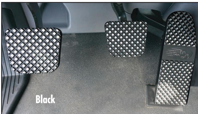
Model No.: RW235-5BP-P Flat Diamond Cut Billet Pedal Set