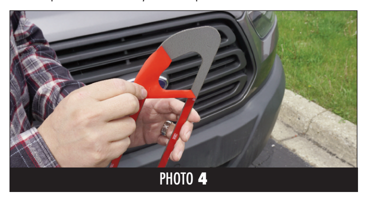
STEP 4 — Removing Backing From Double-sided Tape Beginning with the top grille overlay, carefully remove the backing from the doublesided tape. (See Photo 4)

Important: Before removing any heavy duty 3M Tape backing from the trim accessories, loosely place them in position on the grille to verify how they will fit. Make sure the parts line up and fit side-to-side and top-to-bottom. (See Photo 3)