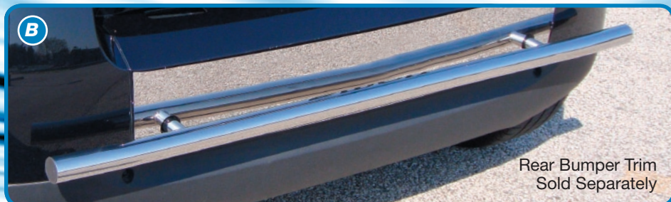
Rear Bumper Trim Sold Separately