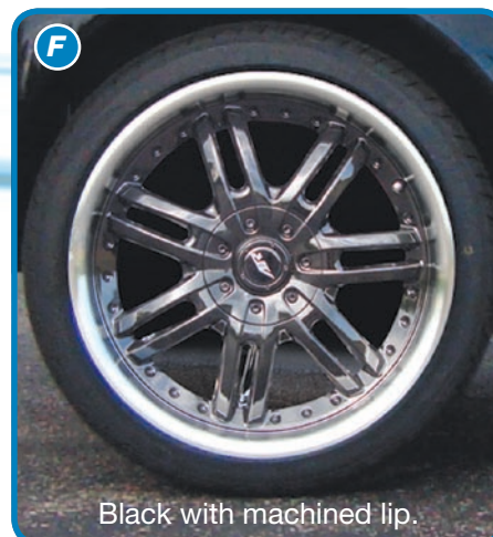
Black with machined lip.