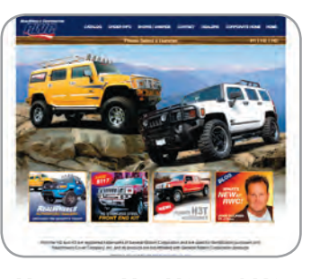
Hummer H1, H2 and H3 Accessories