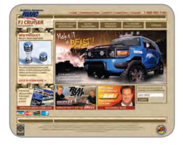
Toyota FJ Cruiser Accessories