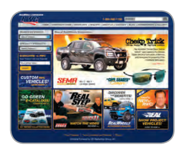
Truck and Auto Accessories

Please visit our web site often for newly released Chevy Camaro Accessories. Do you customize other vehicles? Check out www.realwheels.com for additional vehicle enhancements from the team at RealWheels.