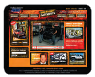
Jeep Wrangler Accessories