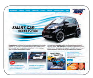
Smart Car Accessories

RealWheels Corporation • 3940 Tannahill Drive • Gurnee, IL 60031 1-800-982-1180 • 847-662-7722 • Fax: 847-662-7744 • www.realwheels.com