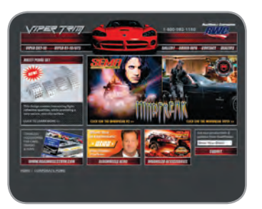
Dodge Viper Accessories