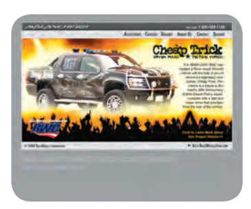
Chevy Avalanche Accessories