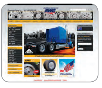
Commercial Vehicle Accessories