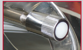
3. Monitors Pressure

Starts flashing RED if the tire pressure drops 5 to 10 psi.