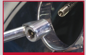
1. Check Tire Pressure

No special tools or key required for installation or calibration.