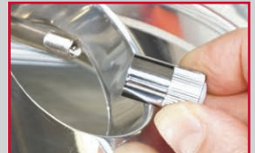
2. Thread On